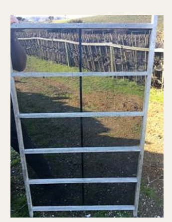
Seed tray 4 years in service, Tasmania Jan 2020