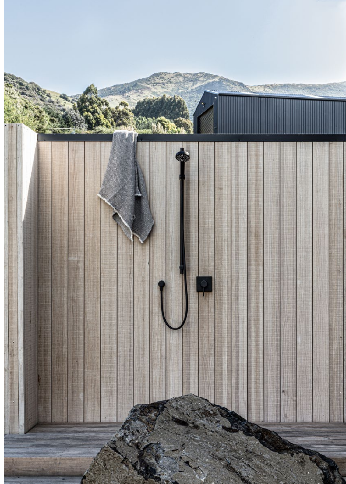
Coastal Banks Peninsula: Photographed six months after completion, Sioo:x on Vulcan Cladding is the perfect material for an outdoor shower.