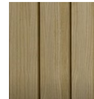
Vulcan Sioo:x / 2 Months