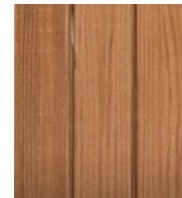
Vulcan Sioo:x / 1 Day