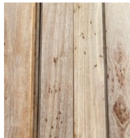
Blackbutt (Eucalyptus Pilularis) hardwood showing leaching of tannins.

Te Hononga Hundertwasser: Vulcan Cladding WB10 145x20 Sioo:x photographed six months after completion, the large eaves haven't prevented the timber weathering evenly.