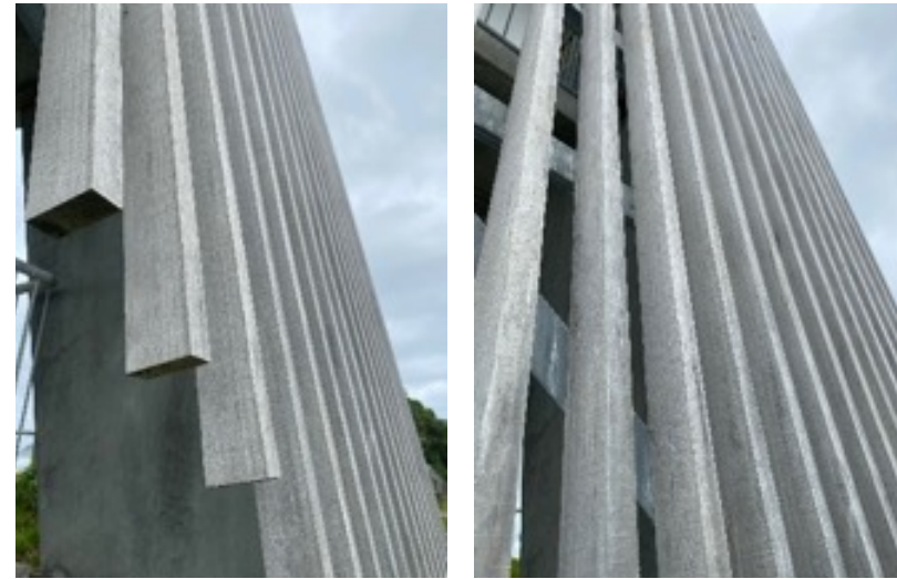
Waimarama Surf Lifesaving Club: Sioo:x on Vulcan Screening after five years, within 100m of the ocean.

Sioo:x solves this problem. As Sioo:x cures it maintains a uniform tone across all faces of the building regardless of exposure to UV. More protected areas such as under eaves may take a little longer to cure however over time the colour tone will be even and uniform throughout.