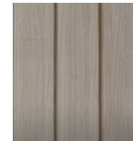
Vulcan Sioo:x / 4 Months